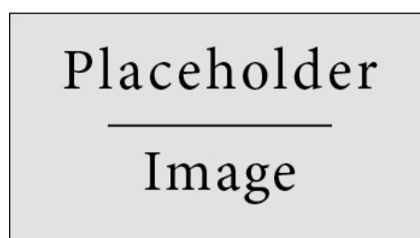
Figure 3.1: Figure caption