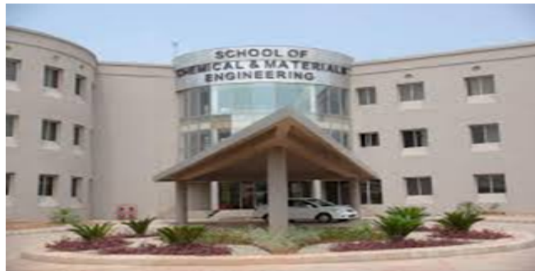
Figure 1.2: Example of a Figure