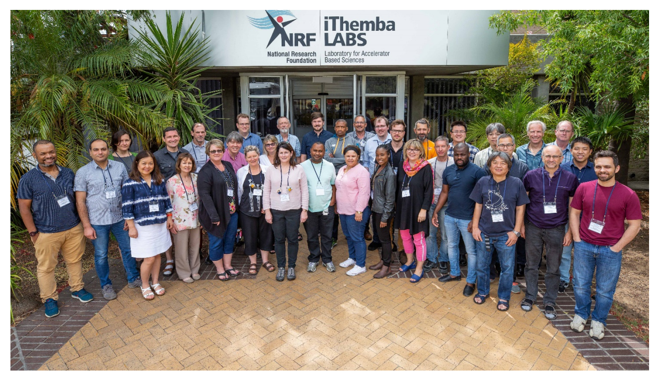
Figure 2: Example of a full-width figure showing the JACoW Team at their annual meeting in December 2018. This figure has a multi-line caption that has to be justified rather than centred.

The names of authors, their organizations/affiliations and postal addresses should be grouped by affiliation and listed in 12 pt upper- and lowercase letters. The name of the submitting or primary author should be first, followed by the coauthors, alphabetically by affiliation. Where authors have multiple affiliations, the secondary affiliation may be indicated with a superscript, as shown in the author listing of this paper. See ANNEX A for further examples.