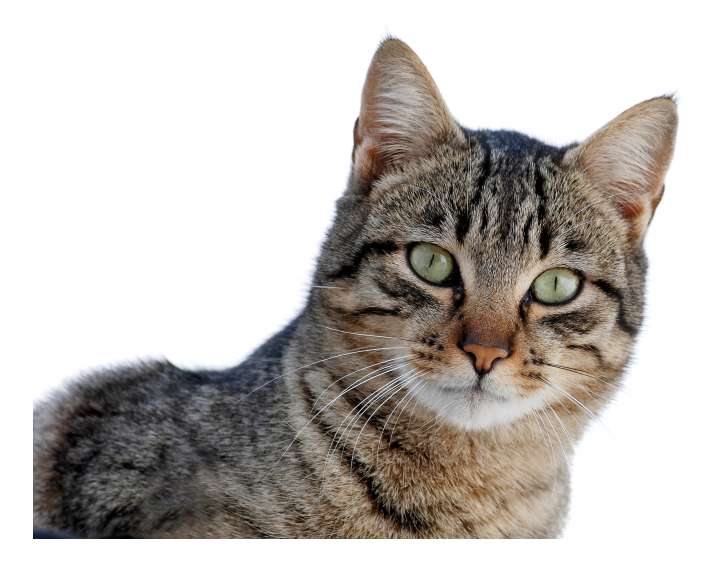
Figure 2.1: A cat looking towards us

An image, inserted as a figure allows you to give it a name and a label to which you may later refer to it.