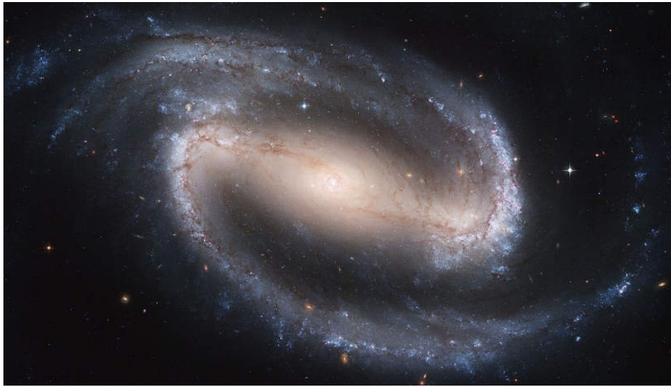
Figure 3: Barred spiral galaxy NGC 1300 photographed by Hubble telescope. While the galaxy in the photo is not our sun, it does emit light, much like our sun.