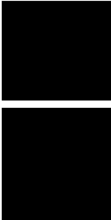
FIGURE 2. Our results: black box (top) and black box (bottom).

(2.) All graphics are provided as separate PDF/PNG/JPG files, all in one zip file.