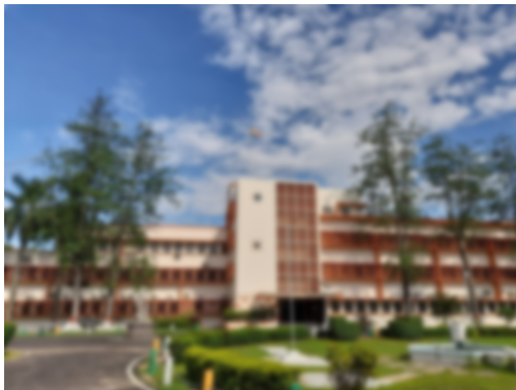
FIGURE 2.1: A picture of CSIR-CMERI passed through a gaussian filter

Here is an example of using a figure 2.1 and referring to it in your document: