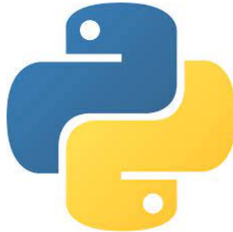
Figure 2: This is the Python logo.

What are the long-term implications of your findings? Wrap up your discussion succinctly while pointing out the significance of your work as well as it what it means for the fields you examined as much as possible. Lastly, suggest ideas for future studies that could build on